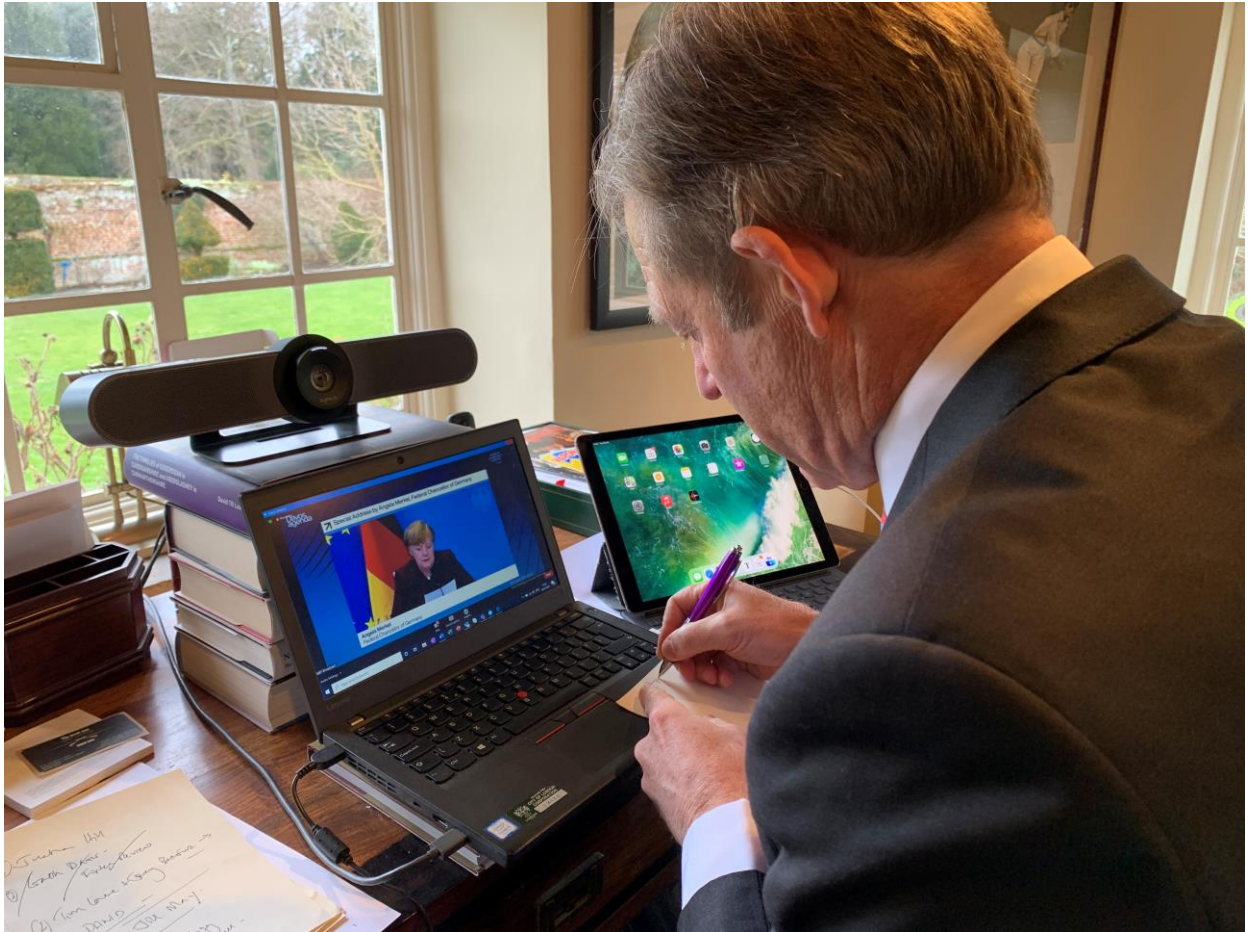
The Lord Mayor participates from home in an online session of the World Economic Forum